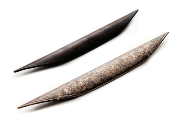
ESOR handles are hand crafted to create a rustic feel in finishes with black, gold, silver, and copper.