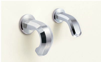
Plate/Screw Set for Knob (ø16)