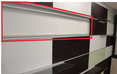
Snap in panels removed