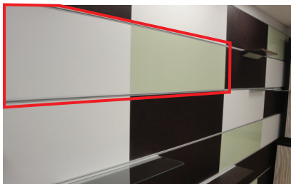
Snap in panels installed