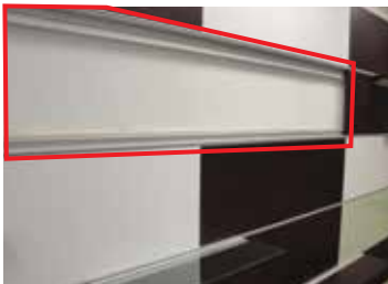
Snap in panels removed