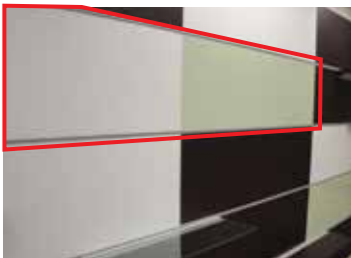
Snap in panels installed