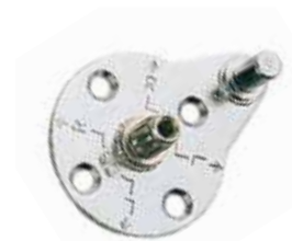
Mounting Plate SDS-A (Included)