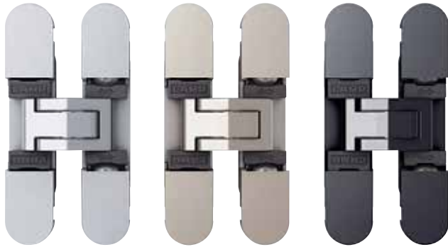
HES3D-70DC Dull Chrome