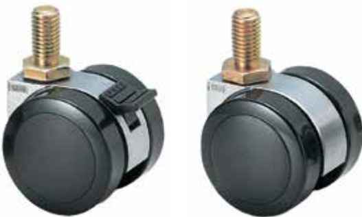
GX-50-N12S (w/ Brake)