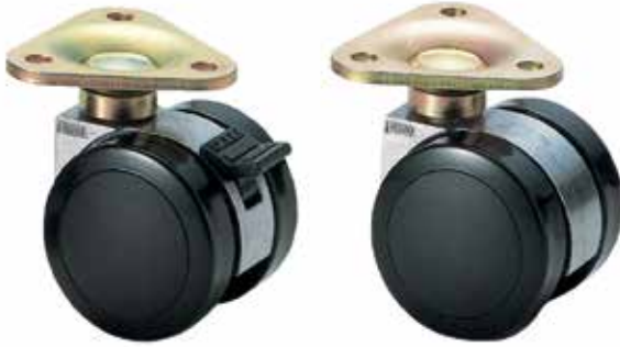
GX-50-PS (w/ Brake)