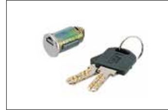
Master Key, Interchangeable Cylinder & Key are sold separately. See P.622