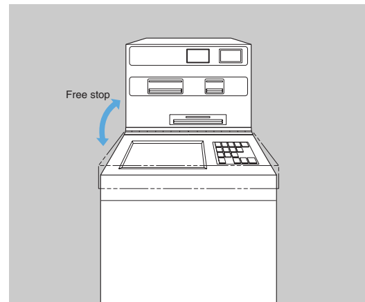
For opening/closing of maintenance machine doors.