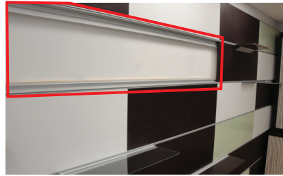
Snap in panels removed