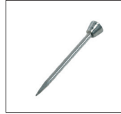
Pin/Stainless Steel \phi 1.5