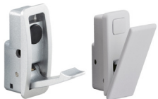
Recessed Hooks NF-60D, NF-45D (SC)