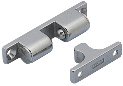
Tension Catches BCTS Series (Stainless Steel), BCTS-85J Series (Adjustable)