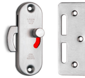
Sliding Door Latches With Indicator HC-85/S