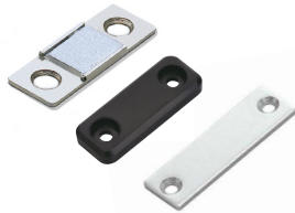
Magnetic Catches MC-JM45, MC-YN001P, MC-JM49 (Counter Plate)