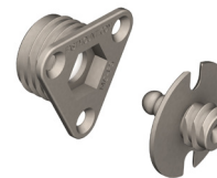
Fastmount® Metal Clips