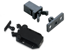
Non-Magnetic Touch Latch ESN-195-3.1(mini), MC-37