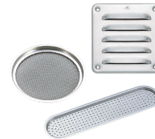
Stainless Steel Ventilators SAM, SAD, 1-1212, ASD