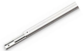
Aluminum Slides AR2/AR3