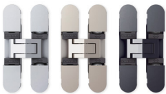
Concealed Hinges HES3D-70