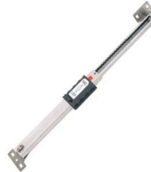
Lid Stay w/ Lock L-FS350A