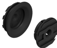
Fastmount® Low Profile Heavy Duty Clips