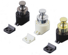
Push Knob For Locking Latch PKL-08