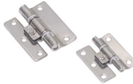
Stainless Steel Torque Hinge SFTH-05-35